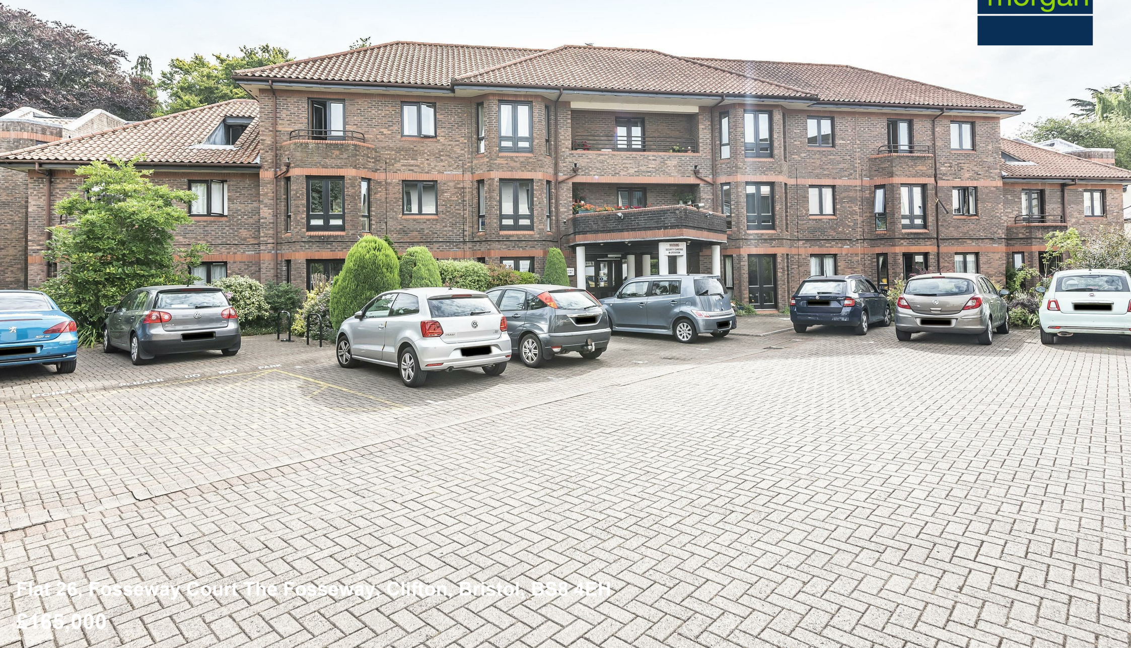
Flat 26, Fosseway Court The Fosseway, Clifton, Bristol, BS8 4PH £165,000